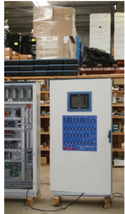
1. A foundation stone of SKOV-FarmMark success – control box No. 106. 2. New modern 1000 sqm warehouse for all spares. 3. SKOV chimney fans. 4. FarmMark staff all present for the certificate presentation.

The SKOV Global Service Distributor scheme, involving an exhaustive audit process, ensures that growers get the best out of the equipment and service provided by highly experienced and technically competent specialists like FarmMark.